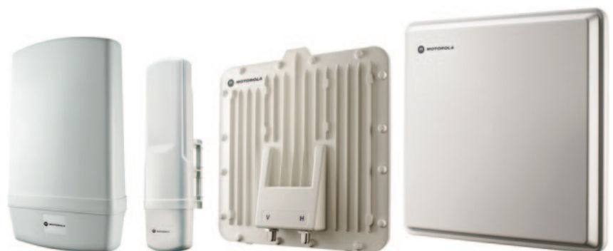
PTP 49200, PTP 58230 and PTP 5X250 Integrated and Connectorized